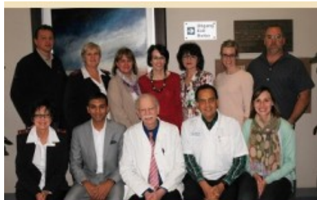
UP's smile makers are changing lives