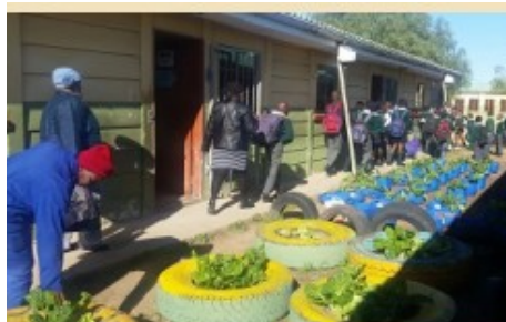
Partners of change in South Africa's education system

The Facial Cleft Deformity Clinic in the Department of Maxillofacial and Oral